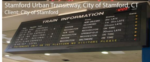
Stamford Urban Transitway, City of Stamford, CT Client: City of Stamford