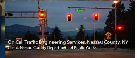
On Call Traffic Engineering Services, Nassau County, NY Client: Nassau County Department of Public Works