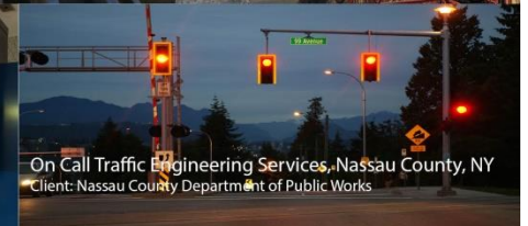
On Call Traffic Engineering Services, Nassau County, NY Client: Nassau County Department of Public Works