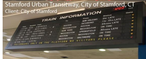
Stamford Urban Transitway, City of Stamford, CT Client: City of Stamford